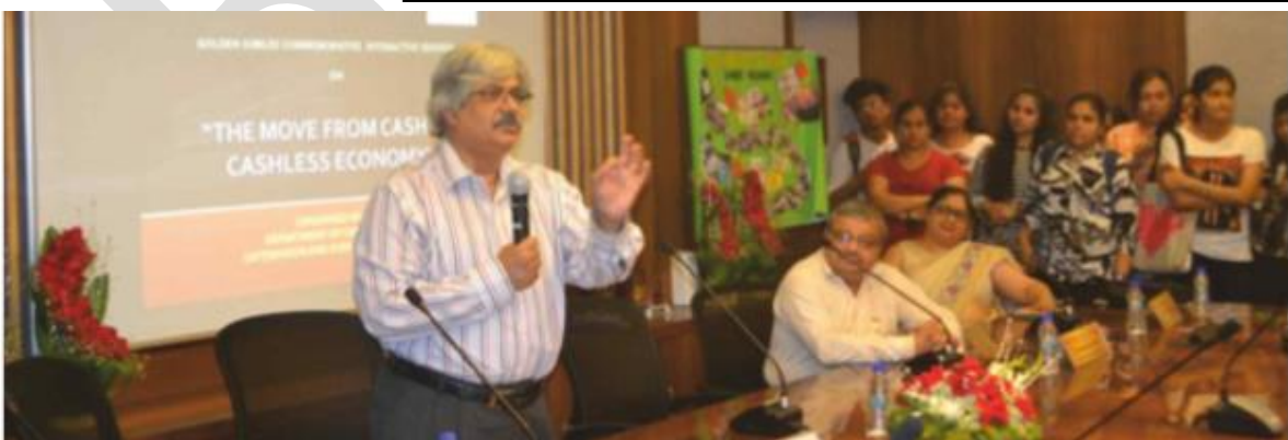
Student Seminar: Cash to Cashless

Estd. & Admin. By: The Bhawanipur Gujarati Education Society Institution Run By The Minority : Affiliated to The University of Calcutta