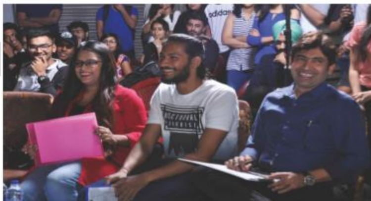
Dance Championship Reloaded

Estd. & Admin. By: The Bhawanipur Gujarati Education Society Institution Run By The Minority : Affiliated to The University of Calcutta