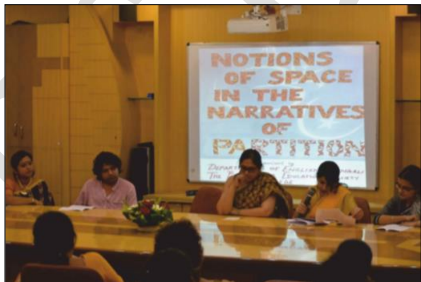
Seminar on the Partition