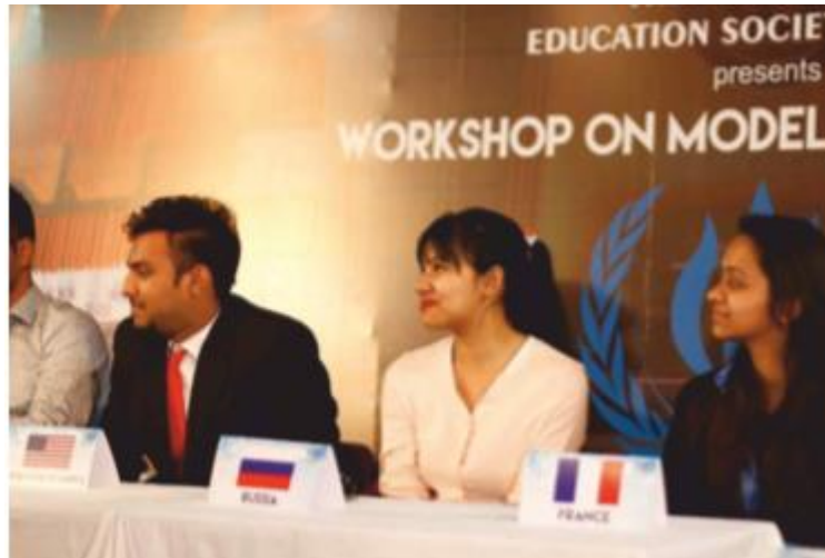
MUN organised by the students of the college