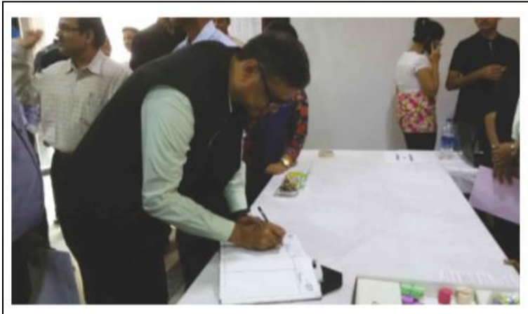
Vice-Chancellor of Calcutta University signing the register at Science Exhibition

5, LALA LAJPAT RAI SARANI, KOLKATA – 700 020 Phone : 4016-5555, Fax : 91 33 2281 4275 Website: www.thebges.edu.in